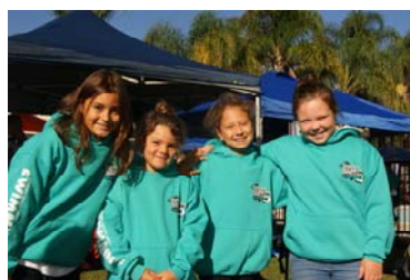
The Junior Girls Relay Team before they went on to win the relay after qualifying for the final in 3rd place.