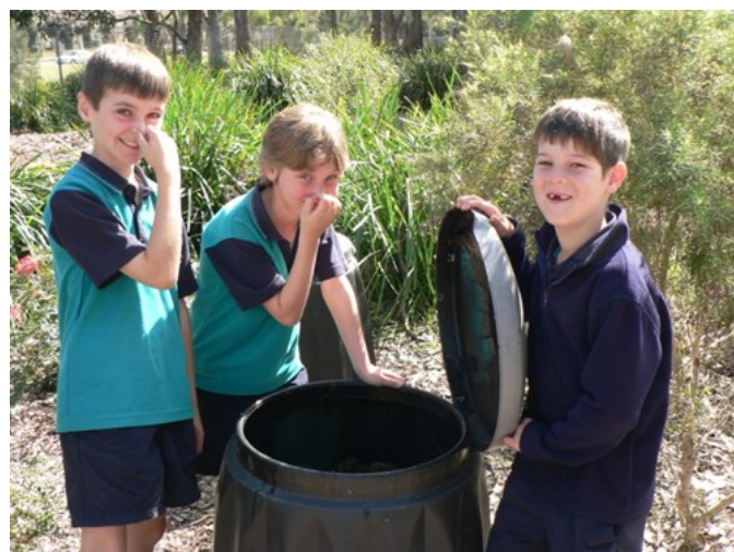
The boys gathering evidence for their environmental review