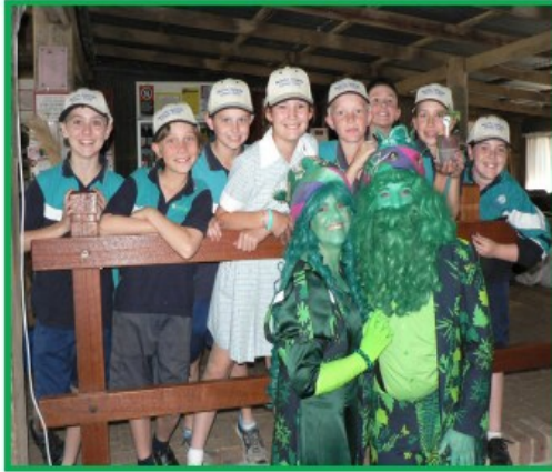
The King and Queen of Green